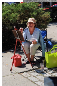
Scenes from previous Paint Bangor Day